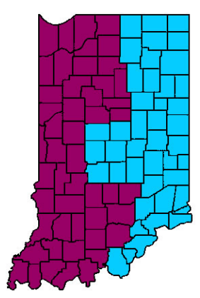
Fig. 2 - 1961 Time Line-Source: Wikipedia.

After the 1961 time line relocation, much of the Central Time Zone portion of Indiana began to observe year round Central daylight. For a time this included St. Joseph County. On 10 September 1962 the common councils of the Cities of South Bend and Mishawaka passed resolutions asking residents, courts and businesses to observe year round "fast time," i.e. Central daylight. Schools adjusted schedules so that children would avoid travel to and from school in darkness. 16